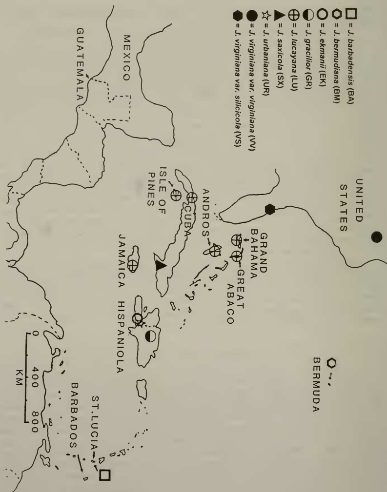
Figure 1. Study area of the Caribbean with population locations. Additional populations of Juniperus lucayana (not sampled) occur on a few of the islands of the Bahamas and in eastern Cuba.